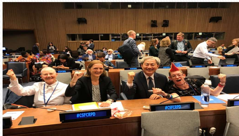
Our peers – our leaders from around the world at the UN Conference of States Parties New York 2018