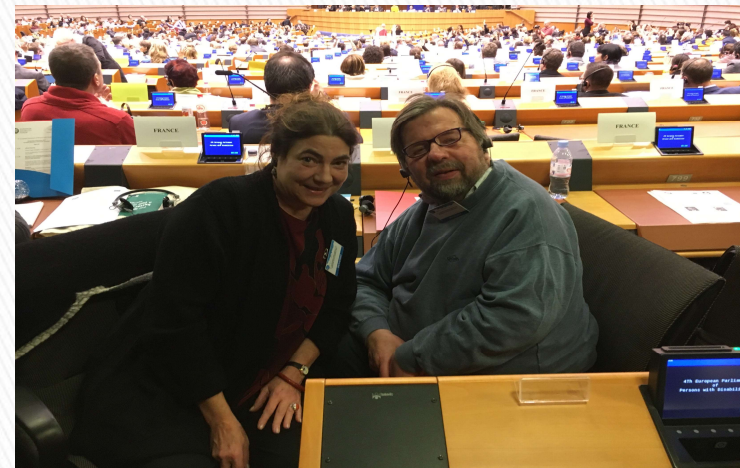
3rd European Parliament of Persons with Disabilities