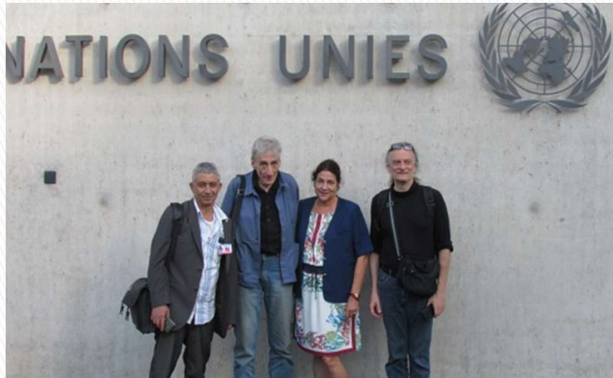
Members of our coalition in Geneva!