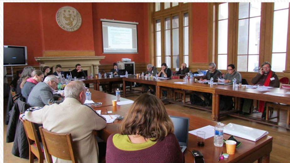
Shadow Reporting seminar Lyons sponsored by Capdroits