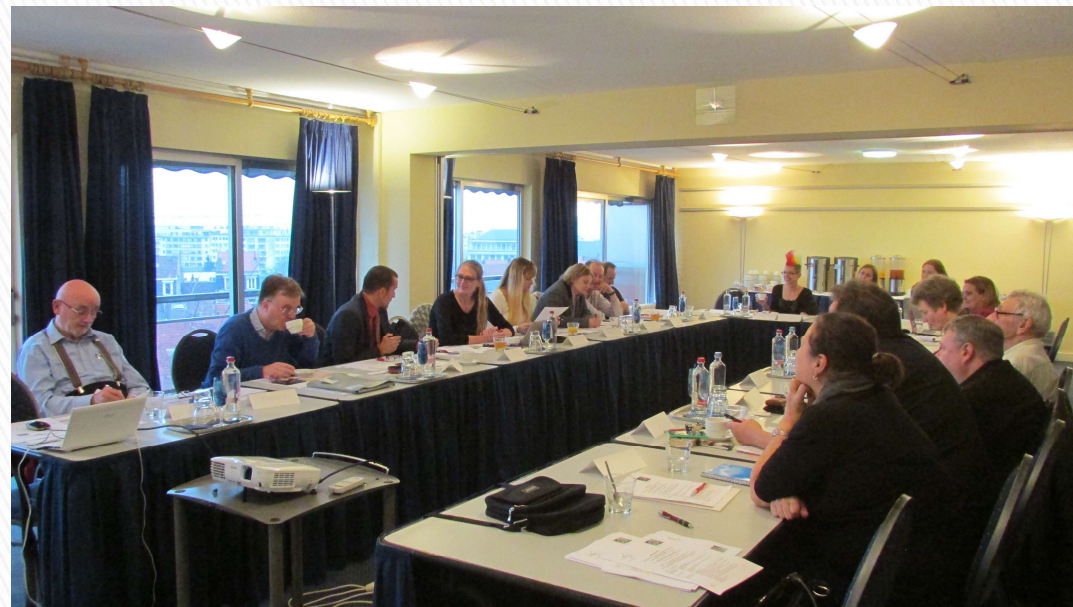
ENUSP Empowerment Seminar Brussels 2015