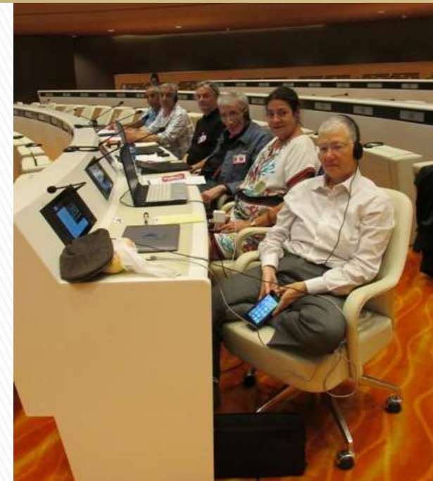
Ready to speak out at the UN at our private briefing with the CRPD Committee