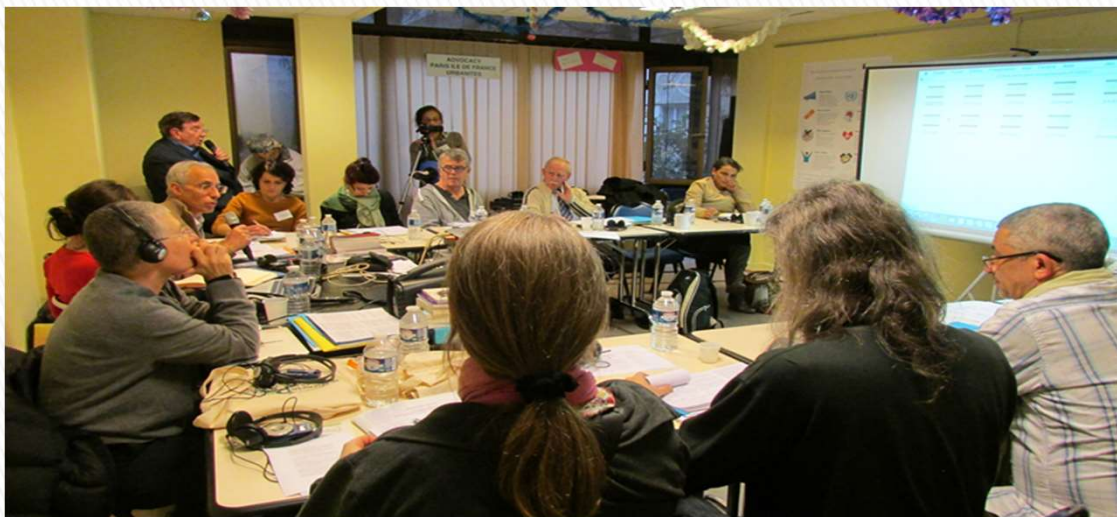
Empowerment seminar and CRPD Training in Paris sponsored by MHE